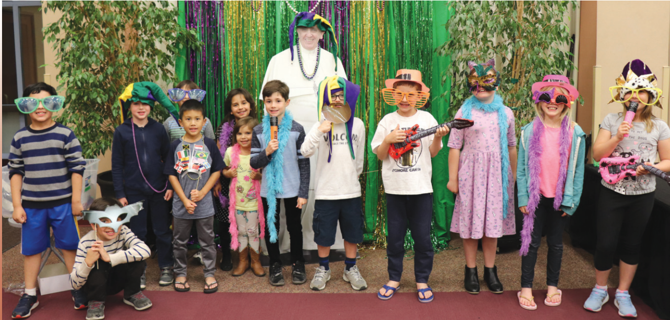
Mardi Gras family celebration 2020, visit www.padreserra.org/news/mardi-gras