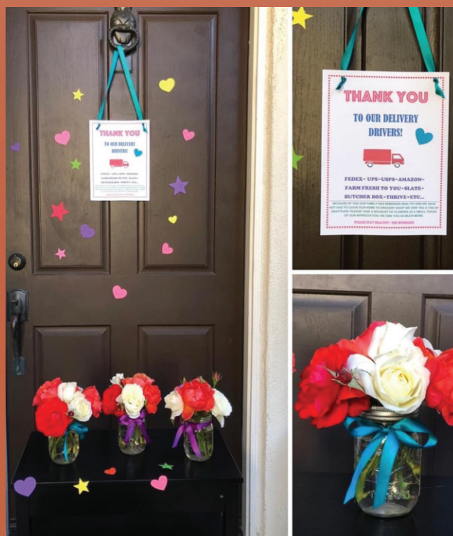
Acts of kindness #psplivingFaith