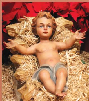
Celebrating the birth of Jesus Christ at Christmas Eve Mass.