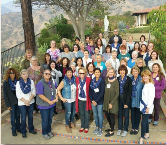
52 women retreated in January to Serra Retreat house in Malibu to experience a "vacation with God."