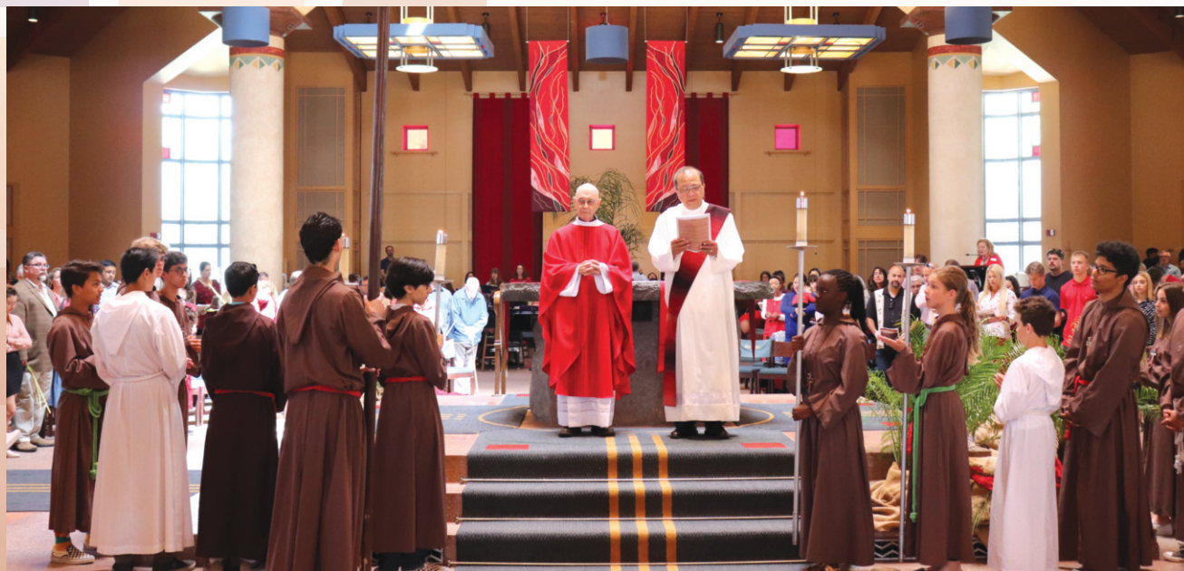
Palm Sunday, Hosanna!