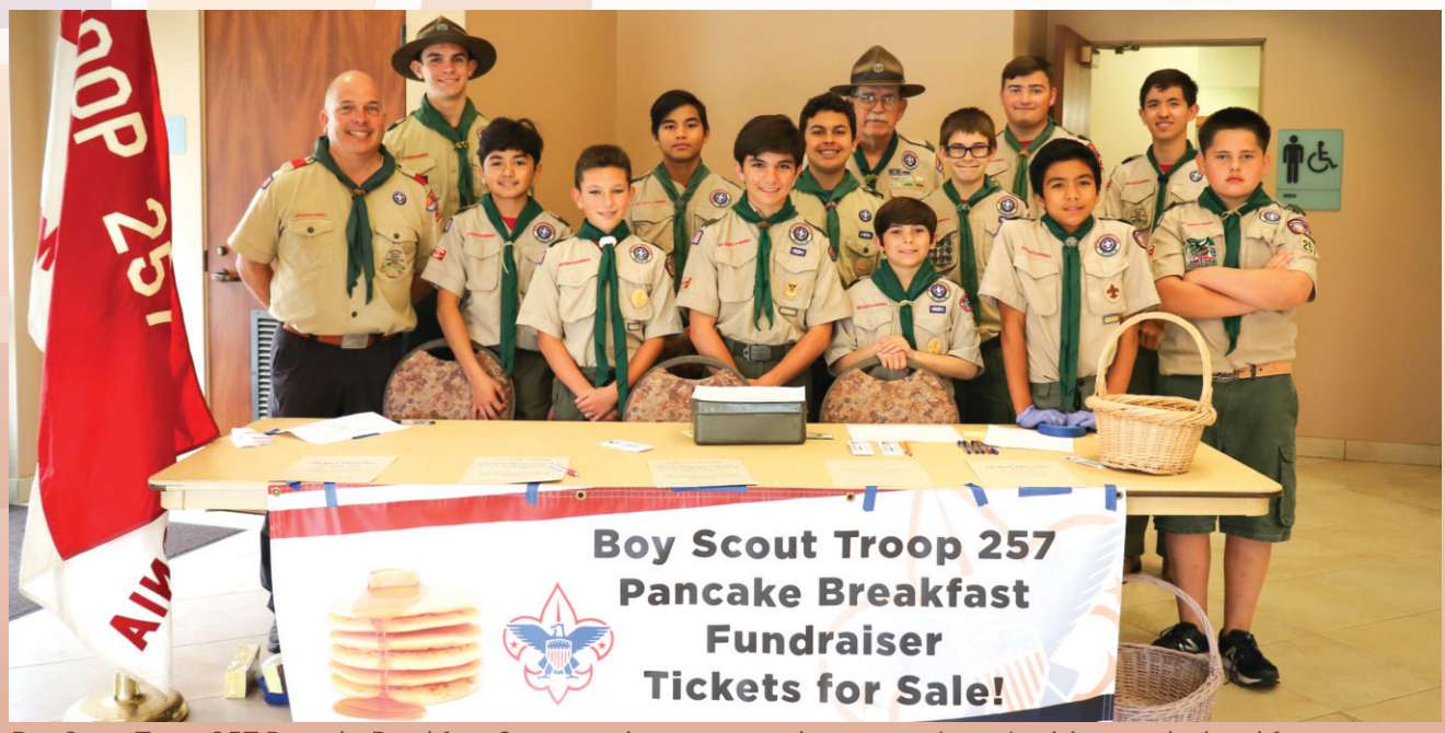
Boy Scout Troop 257 Pancake Breakfast. See more pics at www.padreserra.org/news/parish-pancake-breakfast