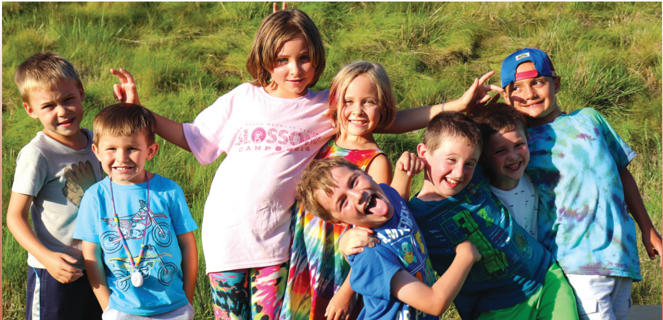
Fridays in the Backyard was a success, thank you! (see page 9). Photo gallery at www.padreserra.org/news/friday

AUGUST 18, 2019 TWENTIETH SUNDAY IN ORDINARY TIME