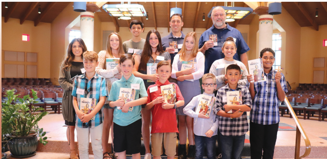
Rite of Acceptance of our new catechumens (learn more on page 9).

OCTOBER 20, 2019 TWENTY-NINTH SUNDAY IN ORDINARY TIME