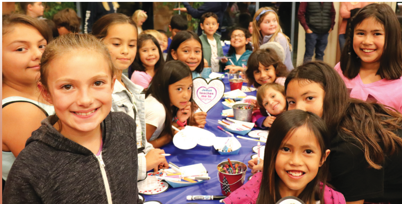
Celebrating forgiveness at the Family Dinner and Reconciliation Service.

NOVEMBER 24, 2019 JESUS CHRIST, KING OF THE UNIVERSE