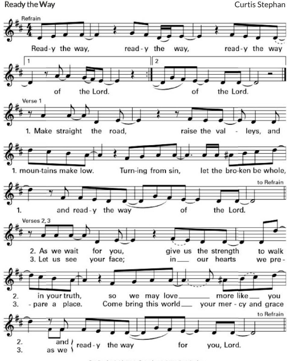
Text: Based on Isaiah 40:3, 4a. Text and music © 2004, Curtis Stephan. Published by spiritandsong.com<sup>8</sup>. All rights reserved.

Go up unto a high mountain, Zion, herald of good news! Cry out at the top of your voice, Jerusalem, herald of good news! Cry out, do not fear! Say to the cities of Judah: Here is your God! Isaiah 40:9