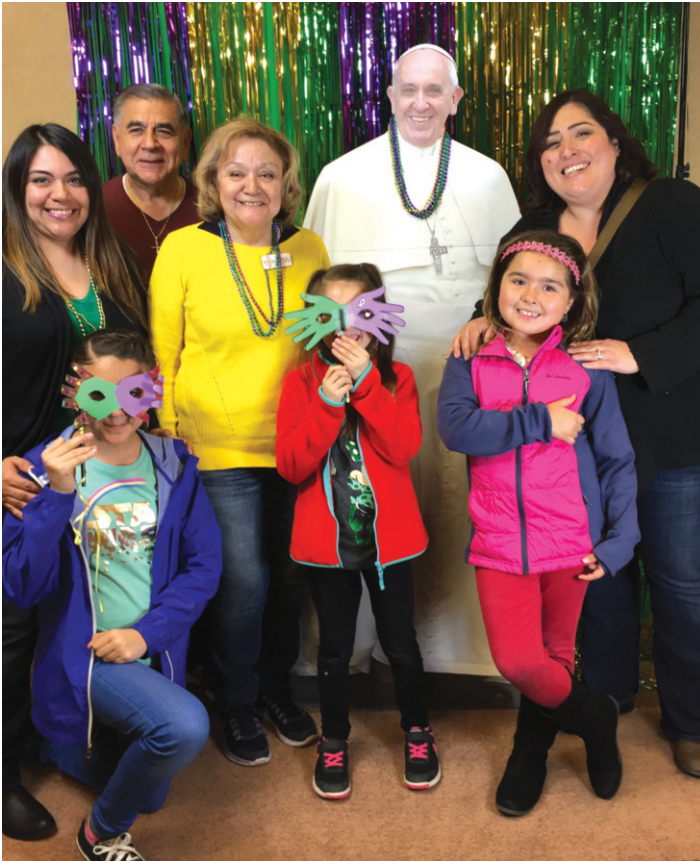
Multi-generation family poses with Pope Francis at Mardi Gras ... wonderful food, fellowship and fun at our Faith Formation family event!!