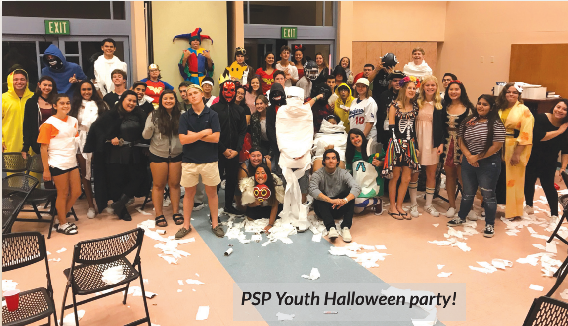
PSP Youth Halloween party!